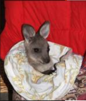
"Abby" Eastern-grey kangaroo ( Macropus giganteus )

If a man aspires towards a righteous life, his first act of abstinence is from injury to animals.