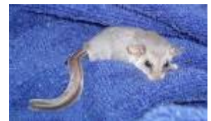
Feathertail glider (Acrobates pygmaeus)

GBWC Inc. holds an overarching wildlife permit issued by the EPA, and they are supported locally by the Qld Parks and Wildlife rangers located at Girraween National Park and Stanthorpe's local vets.