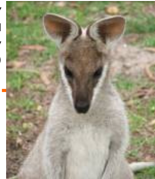
"Alfie" Pretty-face or Whiptail Wallaby ( Macropus parryi )

If you find wildlife in distress, please call a registered wildlife rescuer as soon as possible. Telephone numbers are on the front of this leaflet and in the Granite Belt Informer.